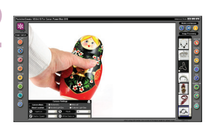
Preview the item in real time on your screen