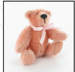
Create your photos in a few clicks