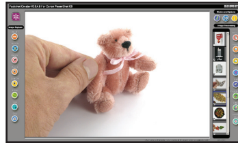
Preview the item in real time on your screen