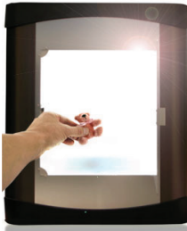
Place the product inside of the lightbox